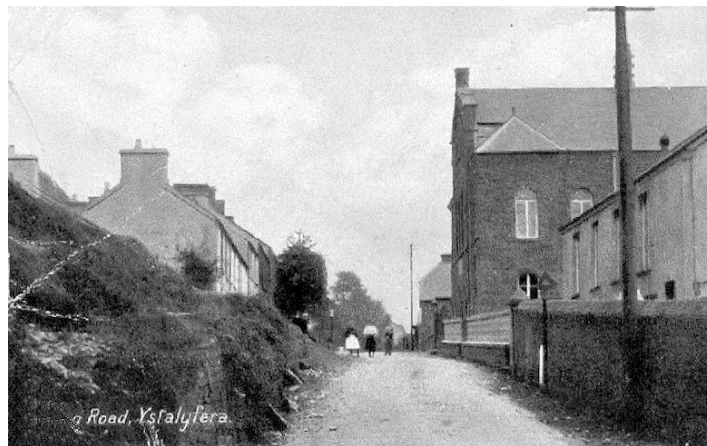
Figure 2: Undated Postcard of Pant-teg Chapel (Ball, 2015)